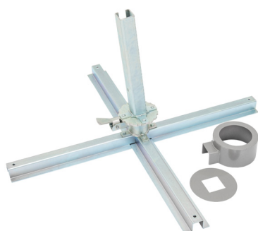
PDUE RIO + rotator